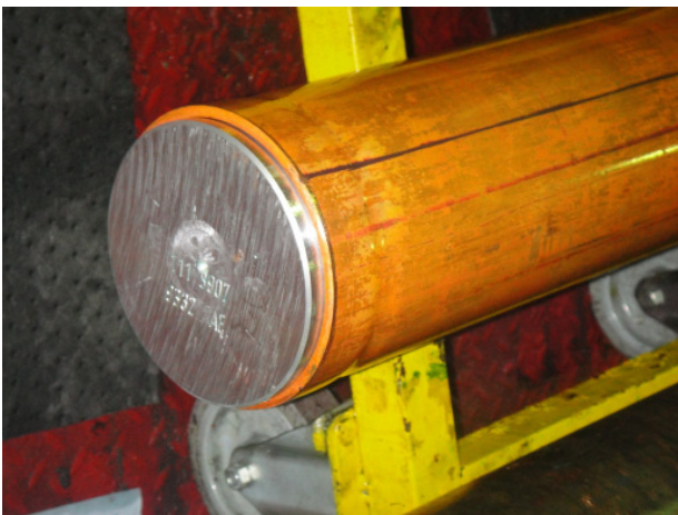
Coating of the outer layer of copper over the aluminium core