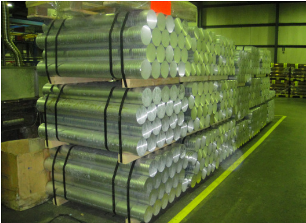
Core of aluminium